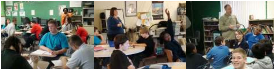
'GATORS hard at work in HS, MS English classes & in their Health class!